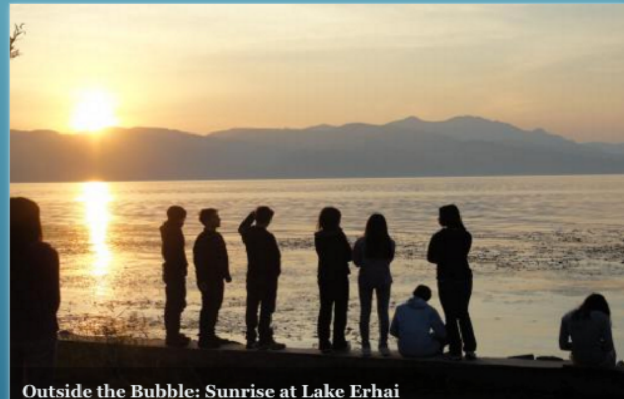
Outside the Bubble: Sunrise at Lake Erhai

The O.R.E.O. group--the fifteenth--will arrive in Xizhou on March 5, 2016. Guests from around the world are encouraged to follow their journey--reading about, responding to, and joining in the learning adventure.